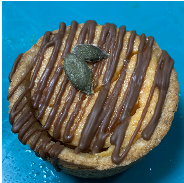
Pumpkin & Cottage Cheese treat by Oksana

what I'm accustomed too in that they have the assembly first and then Bible class. After a little prodding they began to take part in the discussion and our class time just disappeared.